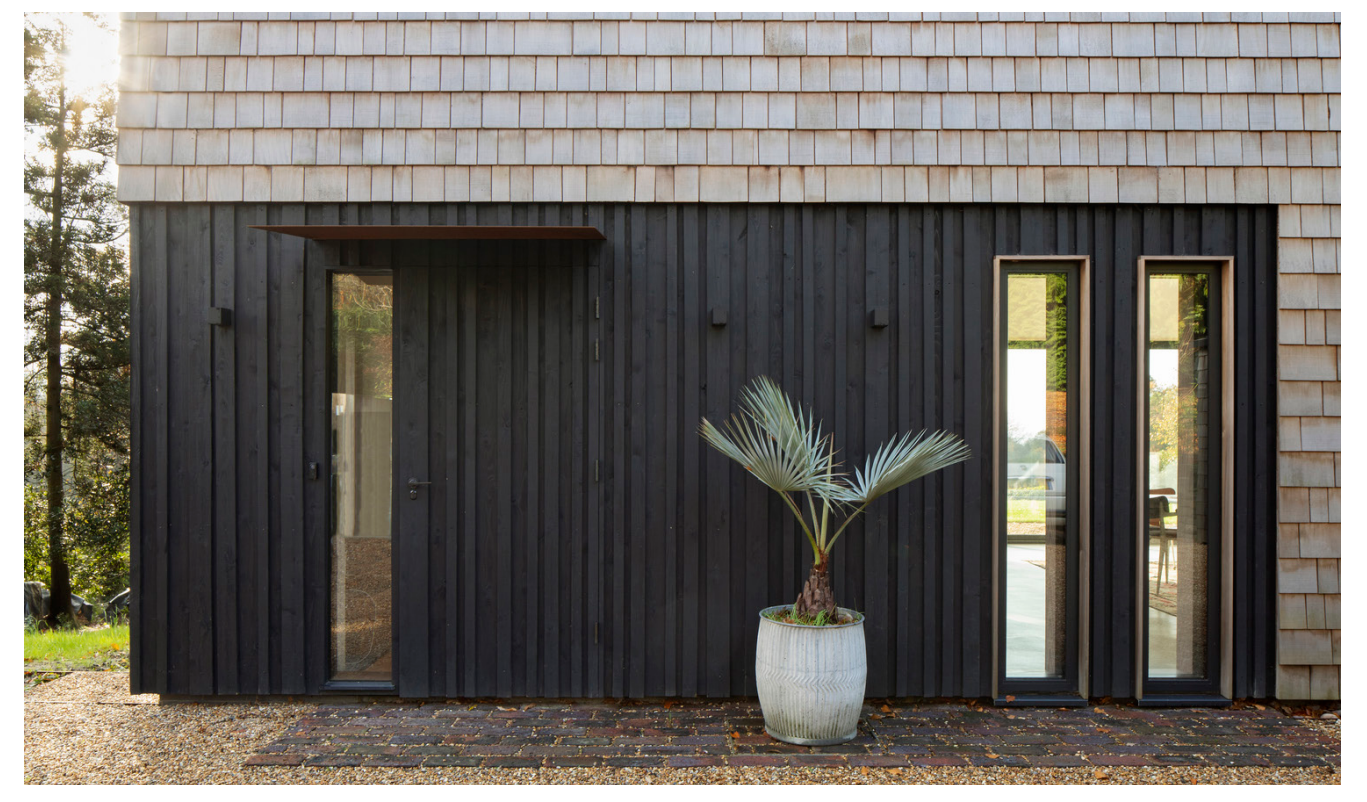
Black Timber cladding